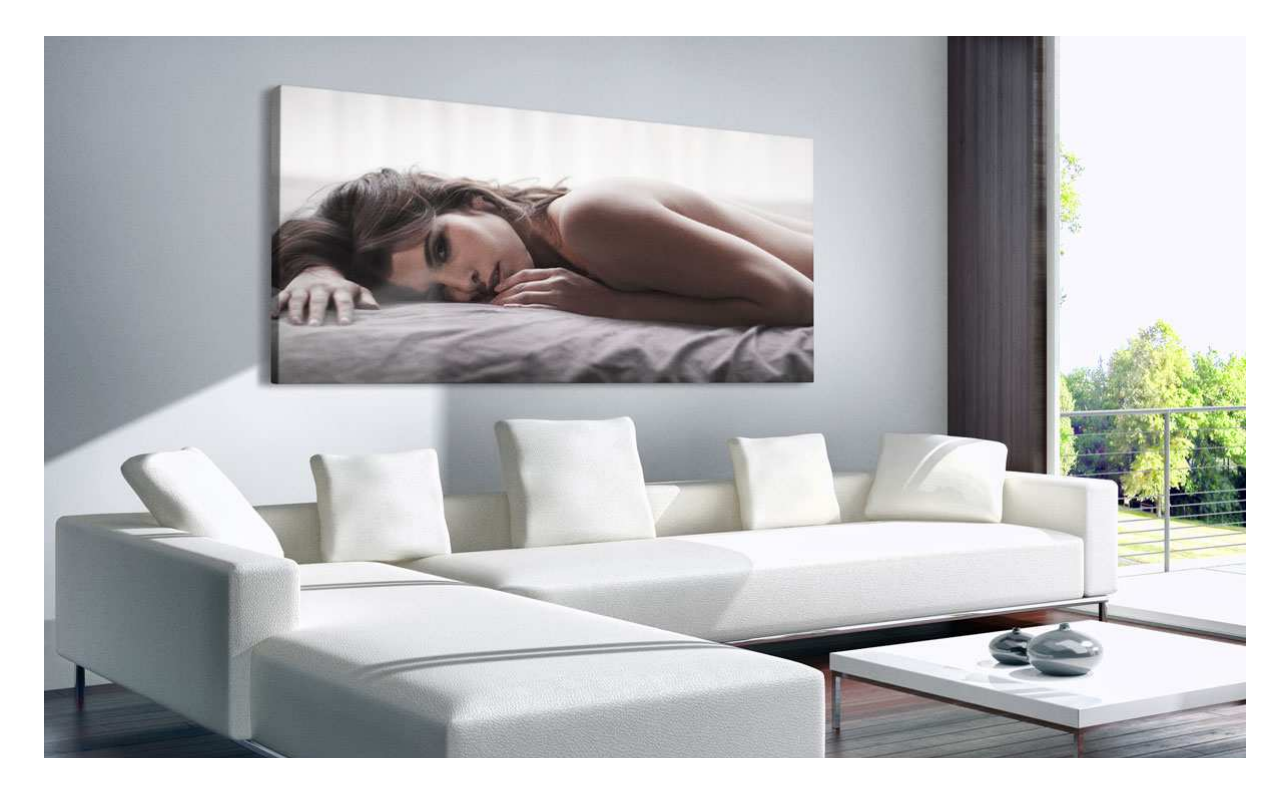
Figure: 240 x 80 cm Photo printed on 8 mm premium acrylic glass.

As a registered professional photographer, use this code for a 10% discount on your first order: